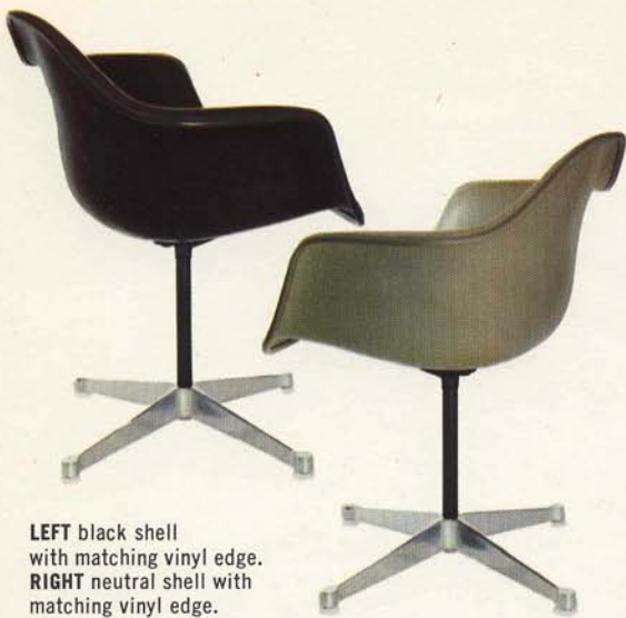
LEFT black shell with matching vinyl edge. RIGHT neutral shell with matching vinyl edge.

BELOW/RIGHT You may order a Dash Ninety-Seven which has a complete Hopsak pad from any of the Hopsak colors shown below or from the Hopsak samples shown in combination at the right. The thirteen recommended fabric combinations for the Dash Ninety-Nine are illustrated in the center column.