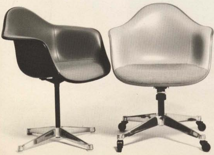
DAT-99 (TILT SWIVEL)

EXCLUSIVE EAMES VINYL EDGE protects the most abused portion of the chair, prevents furniture marring.